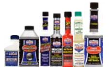
Shelf: LUCAS OIL SHELF