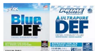
Shelf: DEF OFFERINGS