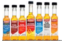
Shelf: GUMOUT OPTIONS