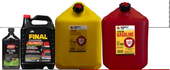
Shelf: ADDITIONAL OPTIONS