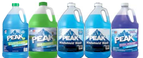
Shelf: WINDOW WASH (reinal)