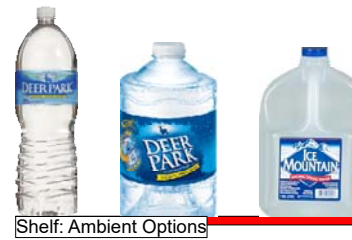
Shelf: Ambient Options